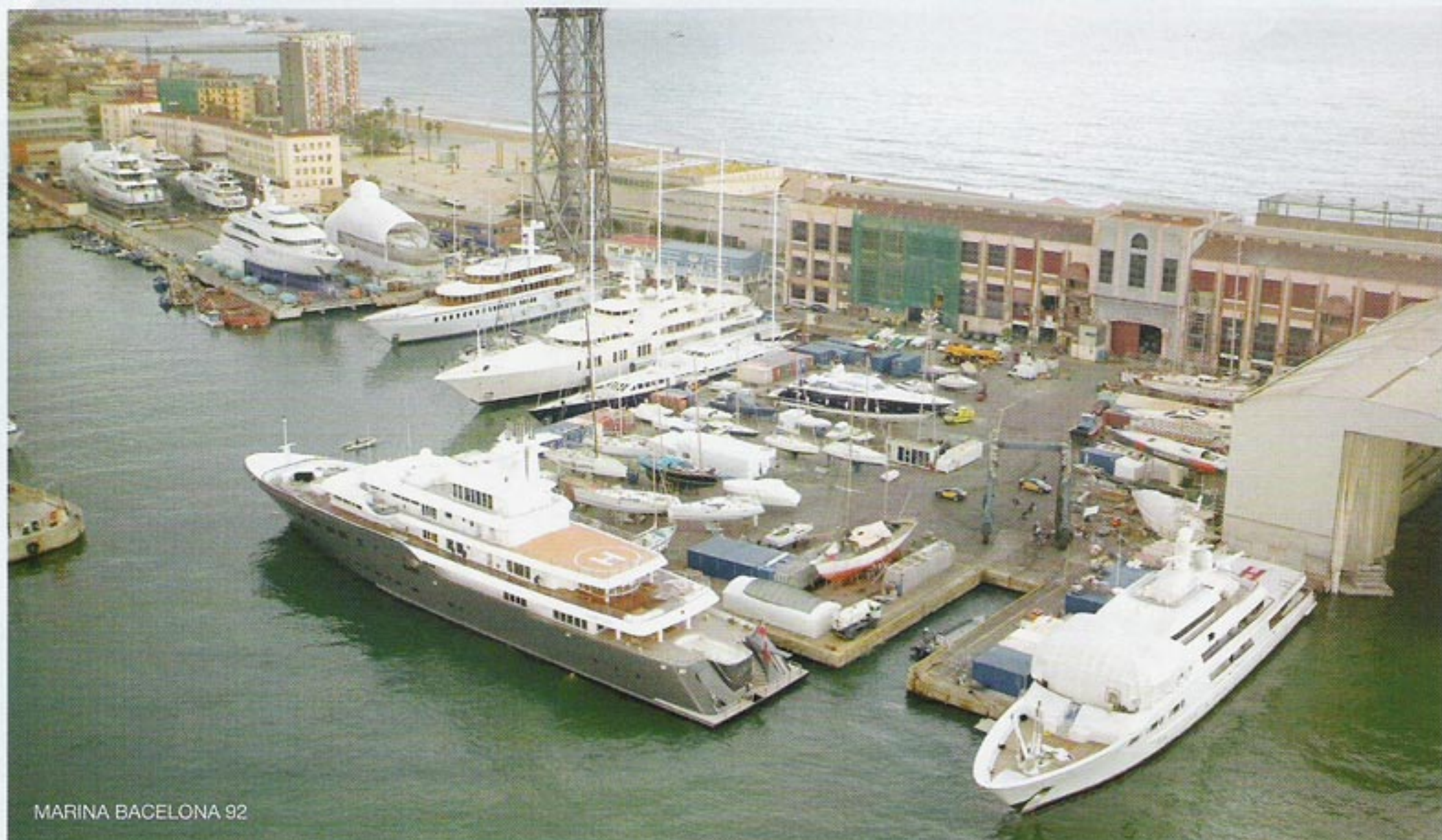
MARINA BAGELONA 92